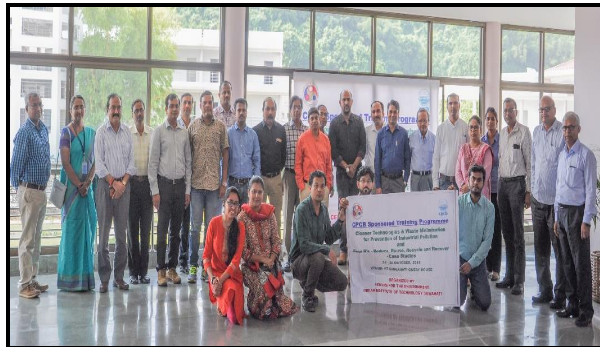
CPCB Sponsored Training program 24-26 October January 2018