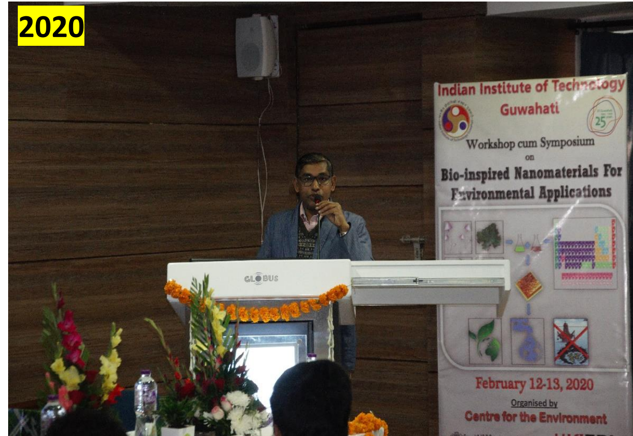
Workshop cum symposium on Bio-inspired Nanomaterials For Environmental Applications, February 12-13, 2020