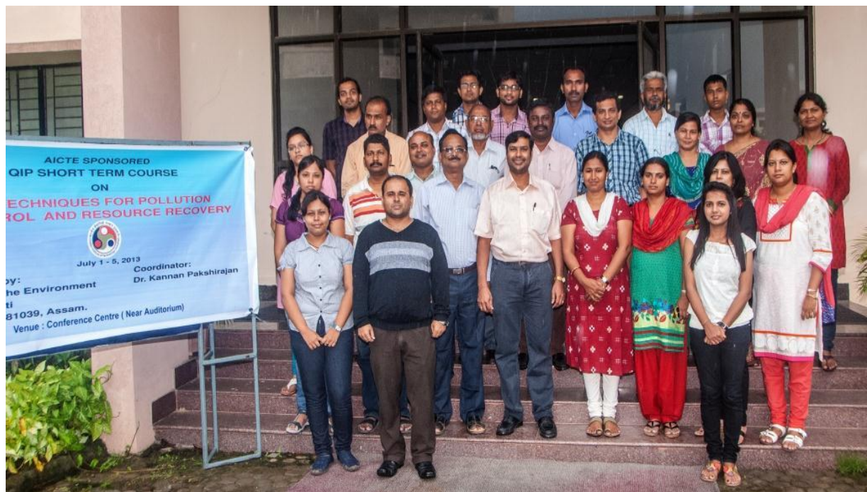
AICTE Sponsored QIP Short Term Course 2013